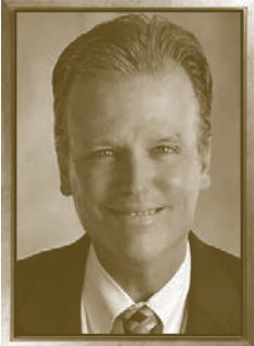
Mayor Jeff Nelson