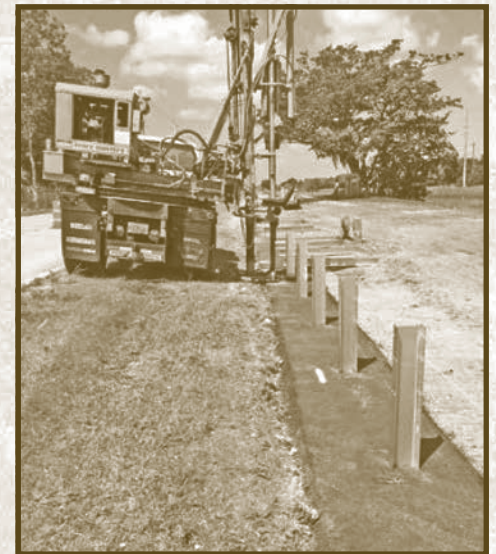
The installation of guardrail along Griffin Road

While construction is ongoing, lanes may be closed and flaggers will direct traffic through closures. The project began on March 7th and is currently expected to be finished by June 7th.